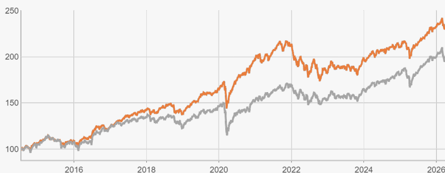
— Fusion ProActive Planet 3 — Benchmark